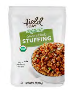
Field Day Savory Herb Stuffing Mix