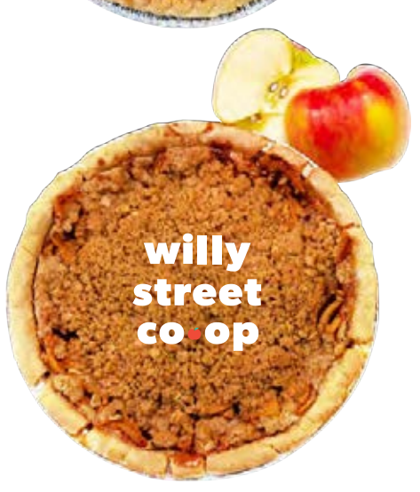
Willy Street Co-op 9" Vegan Made Without Gluten Apple Pie $25.99/ea

6" Mini Door County Cherry Pie $12.99/ea