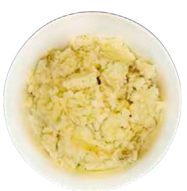
Garlic Mashed Potatoes