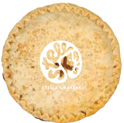
Stella's 8" Apple Pie $20.99 /ea