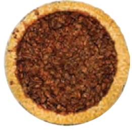
Stella's 6" Pecan Pie $11.99 /ea