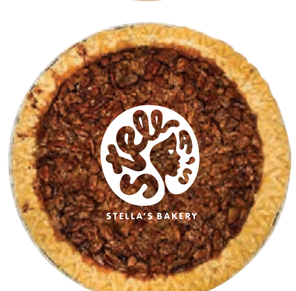
Stella's 8" Pecan Pie $20.99 /ea