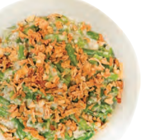
Vegan Green Bean Casserole