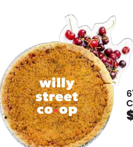
Willy Street Co-op 9" Door County Cherry Pie $23.99 /ea

6" Mini Door County Cherry Pie $12.99/ea