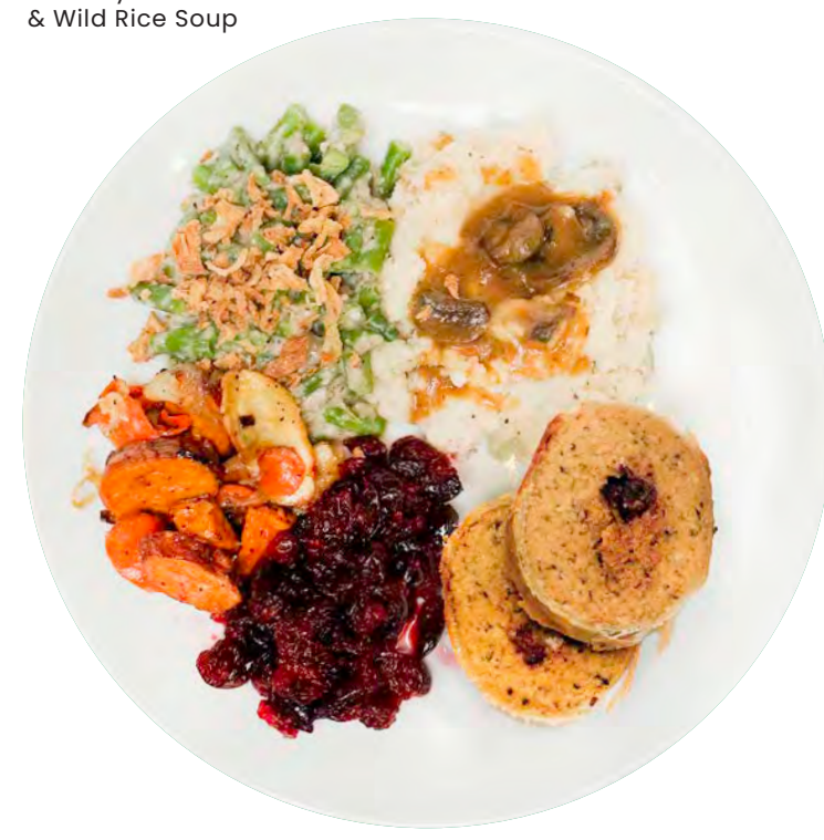
Field Roast Hazelnut & Cranberry Plant-Based Roast